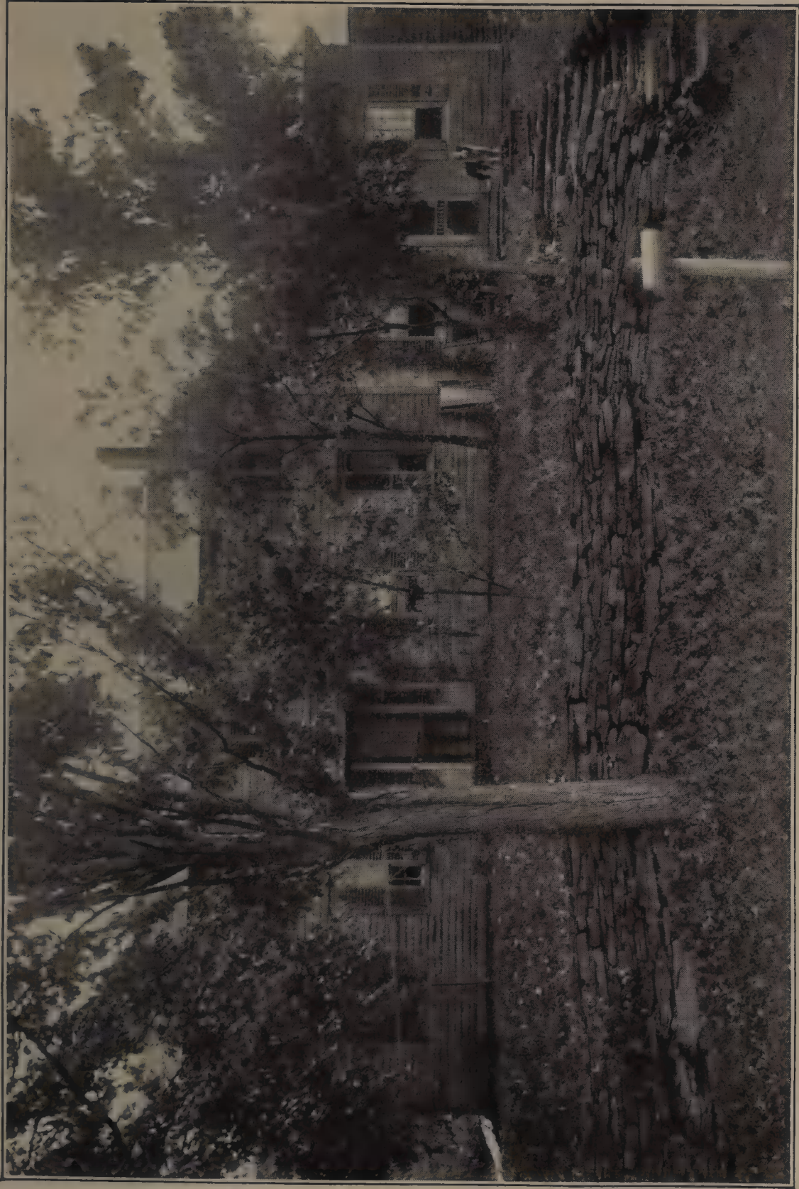
BIRTHPLACE OF JOHN BURROUGHS, ROXBURY, N.Y.